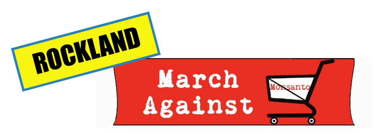
May 25, 2 p.m.